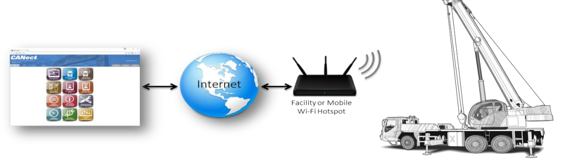
Diagram1: CANect Reflector Architecture

Traditional tools require service personnel to be onsite. Newer technologies allow service personnel to perform the high-speed trouble shooting and plan service work remotely. Internet enabled service tools allow service personnel to virtually commute to the vehicle, troubleshoot it, and either send parts or show-up prepared with parts in advance – reducing cost of service.