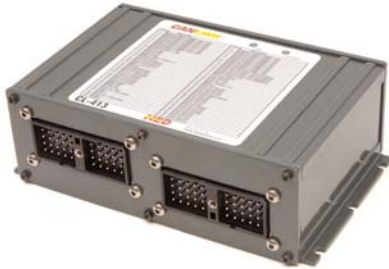
Representative Product Photo

The CL-422 is a solid-state microprocessor based module and member of the HED® CANLink® multiplexed control family. Delivered in an aluminum enclosure, this unit provides a large and highly flexible I/O count in a compact package.