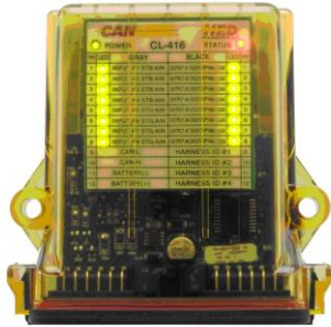
Representative Product Photo