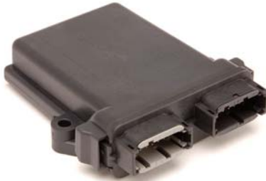
Representative Product Photo