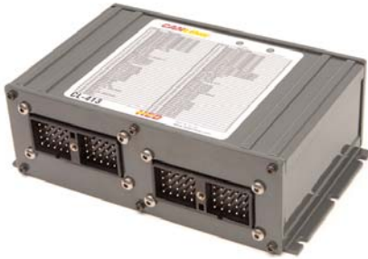
Representative Product Photo